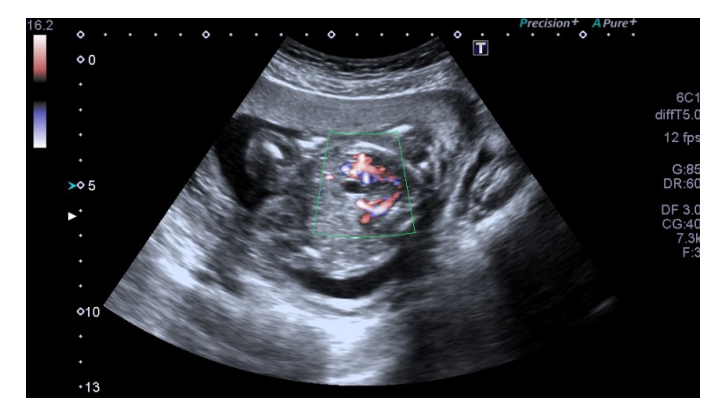
Figure 2. Color flow in the mass with tortuous vessels.

Figure 1. Lobulated multicystic mass of approx. ,3.2 x 2.8 cm size (arrow) in left hypochondrium of fetal abdomen displacing the stomach.