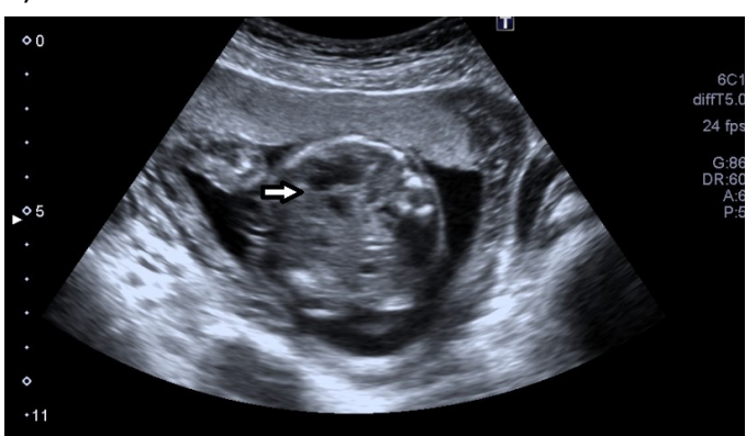
Figure 1. Lobulated multicystic mass of approx. ,3.2 x 2.8 cm size (arrow) in left hypochondrium of fetal abdomen displacing the stomach.

A 22 years-old, healthy, Primigravida Nepalese woman presented for an obstetric anomaly ultrasound scan at 20 weeks of gestational age (GA) to our radiology department. Until then she had only one scan at 8 weeks of pregnancy. A 3.2cm x 2.8cm multicystic mass was seen in the left hypochondrium of the fetal abdomen displacing the stomach (Figure 1).